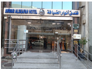
Anwar Deafah Hotel (OR Similar)