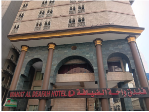
Waha Al Deafah Hotel (OR Similar)