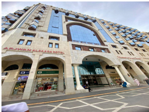
Erjwaan Saada Hotel (OR Similar)