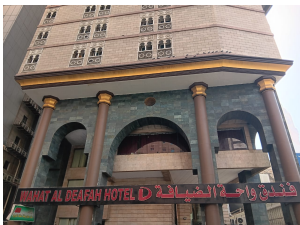
Waha Al Deafah Hotel(OR Similar)