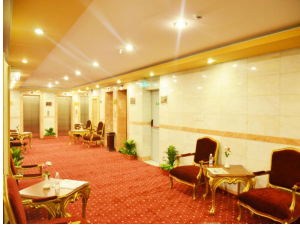
Burj Al Deafah Hotel(OR Similar)