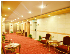
Burj Al Deafah Hotel(OR Similar)