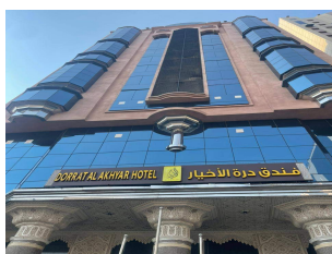
Dorrat Al Akhyar Hotel (OR Similar)