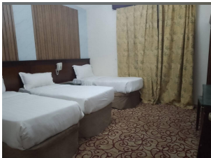
Sebal Plus Hotel (OR Similar)