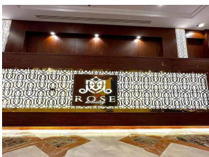
Rose Holidays (OR Similar)