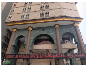
Waha Al Deafah Hotel(OR Similar)