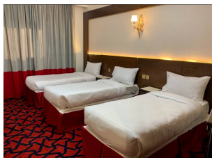
Mona Salam Hotel(OR Similar)