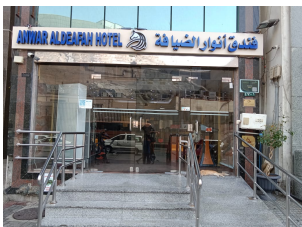
Anwar Deafah Hotel (OR Similar)