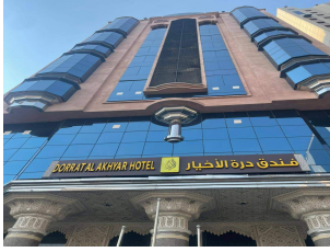
Dorrat Al Akhyar Hotel (OR Similar)