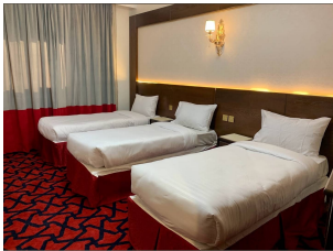
Mona Salam Hotel (OR Similar)